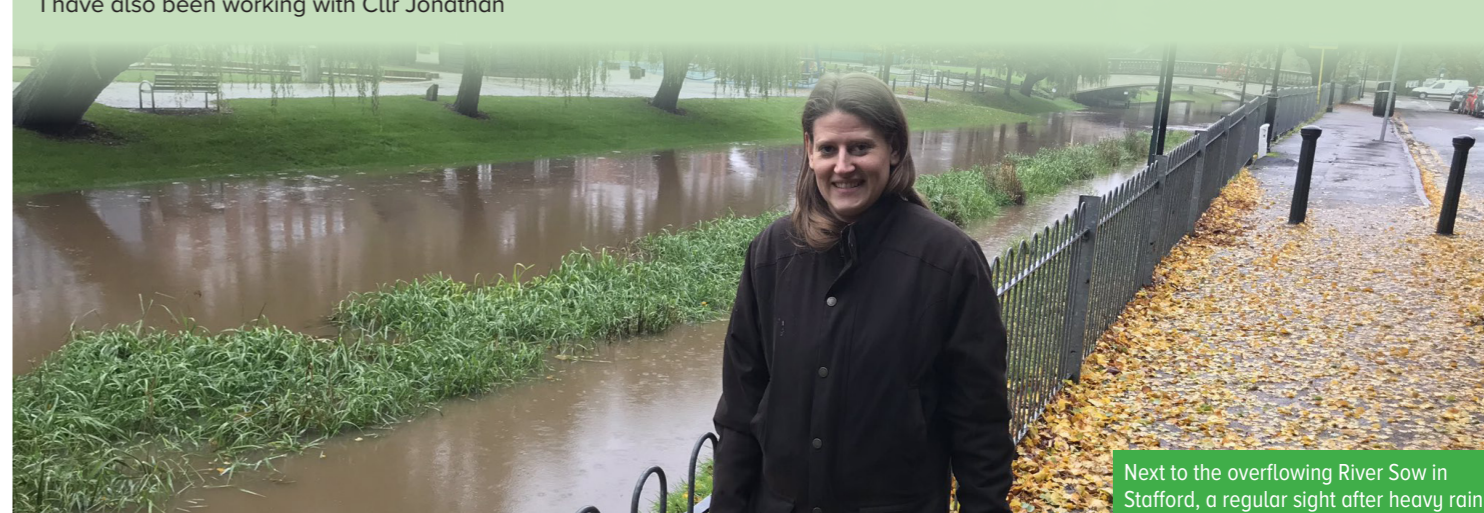
Next to the overflowing River Sow in Stafford, a regular sight after heavy rain.