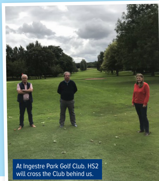
At Ingestre Park Golf Club, HS2 will cross the Club behind us.