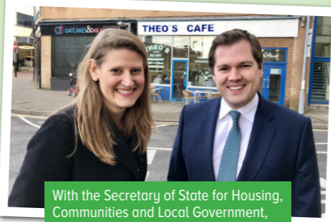
With the Secretary of State for Housing, Communities and Local Government, the Rt. Hon Robert Jenrick MP, pushing for improvements to Stafford's town centre and High Street.

that following the Rt. Hon Robert Jenrick MP's visit to Stafford, Stafford Borough Council's bid to the Future High Streets Fund has been successful. This additional over £14,000,000 in Government funding, combined with the work to reopen Shire Hall, will make a huge difference and help the town centre of Stafford prosper. ■