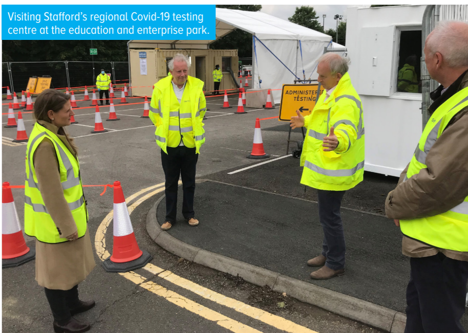
Visiting Stafford's regional Covid-19 testing centre at the education and enterprise park.

Since the beginning of the coronavirus pandemic I raised repeatedly with Ministers, in both the Department of Health & Social Care and the Ministry of Housing, Communities & Local Government, the need for my constituents to have a local test centre. I therefore was delighted that Stafford was given its own regional test site. When visiting the site I was very impressed to see how efficiently it is being run and I am pleased that my constituents now have somewhere local to go if they need a Covid-19 test.