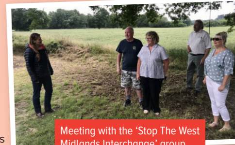
Meeting with the 'Stop The West Midlands Interchange' group.

I would also like to put on record my sincere thanks to the 'Stop The West