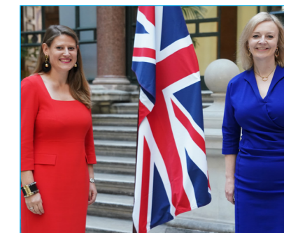
With the Rt. Hon Liz Truss MP, Secretary of State for International Trade.

I was delighted to be appointed by the Prime Minister as the Trade Envoy to Kenya and pleased to be at the recent signing of the UK Kenya trade agreement. I have held numerous meetings with Staffordshire County Council and Staffordshire Chamber of Commerce this year. I will continue to work with businesses in my Stafford constituency to encourage them to export. ■