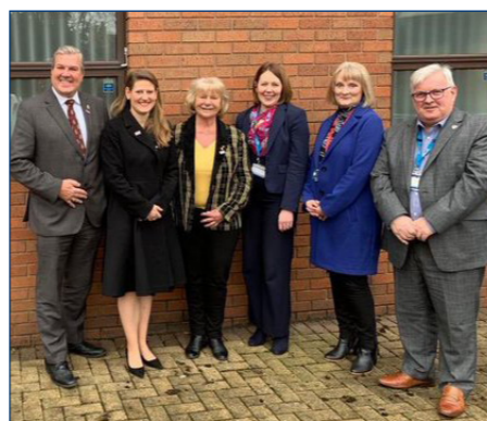
Visiting St George's Hospital in January 2020 to see the important work that is being undertaken in relation to mental health in Stafford.

I was delighted to be able to launch the Stafford Mental Health Network alongside the Midlands Partnership NHS Foundation Trust. The Network is designed to help bring local residents and organisations together to discuss all the issues surrounding mental health and to ensure that everyone who needs it is provided with information about how they can access suitable mental health support. ■